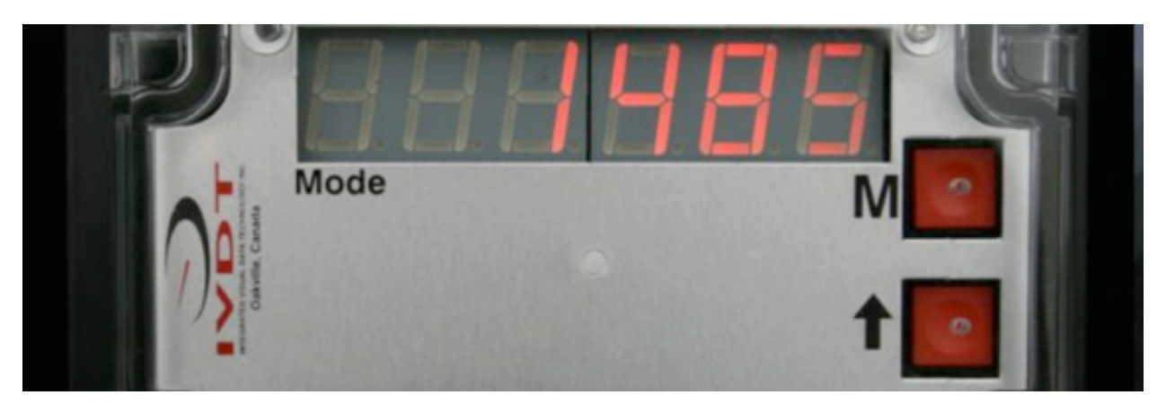
Mode LED Digit