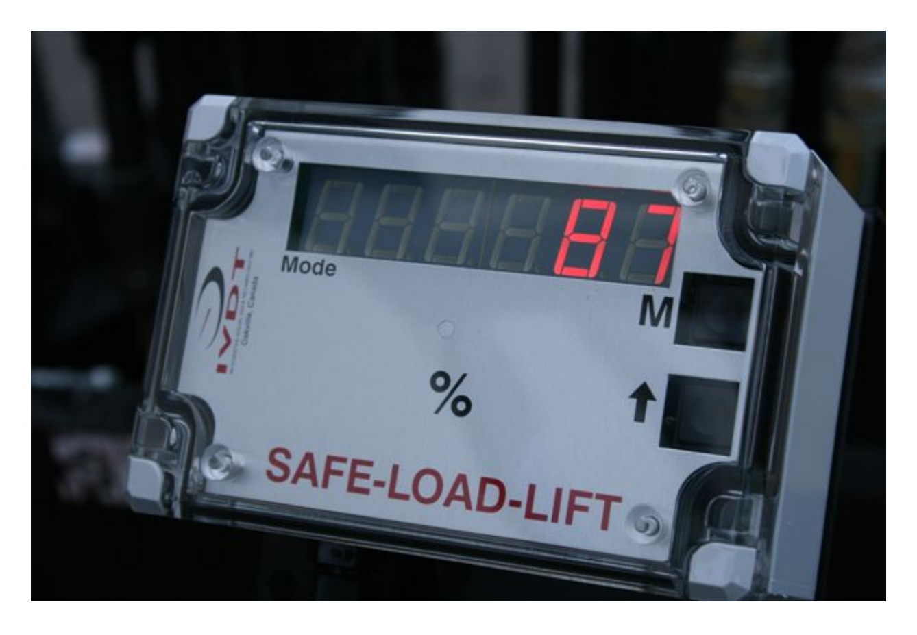
ED2-SLL Series SkidWeigh System

Lift Truck On-board Load Weight Shown In % Of Vehicle Lifting Capacity